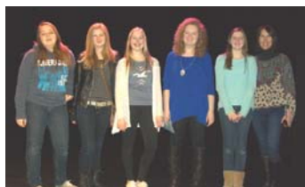
Northland Parkway Collegiate Students