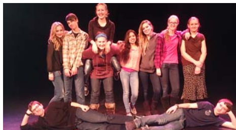
Morden Collegiate Students